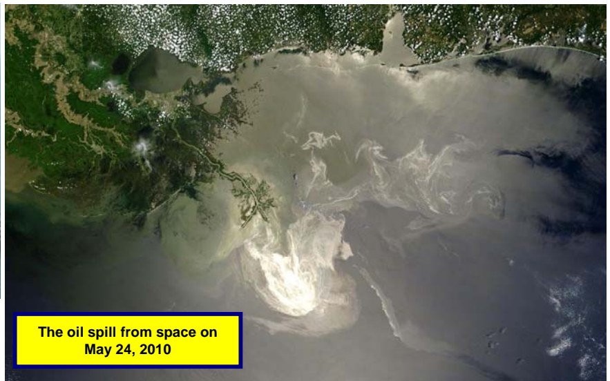
The oil spill from space on May 24, 2010

On April 20, 2010 an explosion on the Deepwater Horizon drilling rig, operating in the Gulf of Mexico off of the coast of Louisiana, killed 11 workers and injured 17 others. Approximately 36 hours later the rig sank. The resulting oil spill from the damaged well head is the largest in United States history. This incident has been a major news story throughout the world. As this Beacon is being written, oil continues to leak from the well. It is too soon to know the specific causes of this incident, and there will be a number of investigations in the