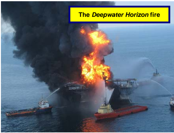
The Deepwater Horizon fire