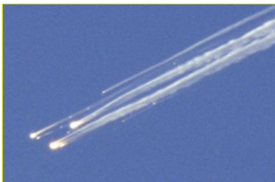
February 2003, Space Shuttle Columbia breaks up during re-entry