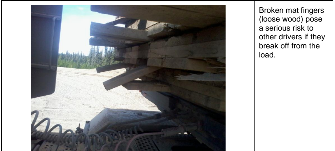
Broken mat fingers (loose wood) pose a serious risk to other drivers if they break off from the load.